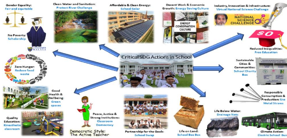
Figure 1. Critical SDGs actions in schools